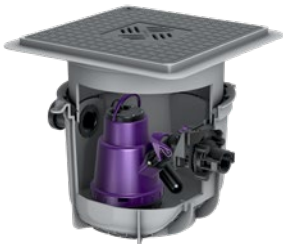
Illustration shows Art. no. 280 570S