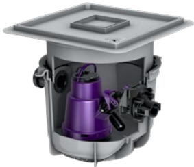
Illustration shows Art. no. 280 570X

Single removable KTP pump for wastewater without sewage, float switch, with multi-vane impeller, with integrated non-return flap, pressure pipe connection 40 mm.